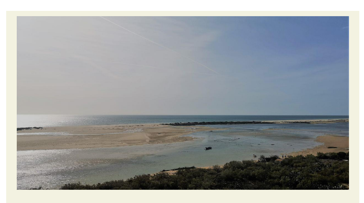
Beaches of Ria Formosa and Deserted Islands

Enjoy the beauty of the deserted islands along the eastern coast of the Algarve. A romantic catamaran cruise at sunset or a family outing with lunch on the beach!!