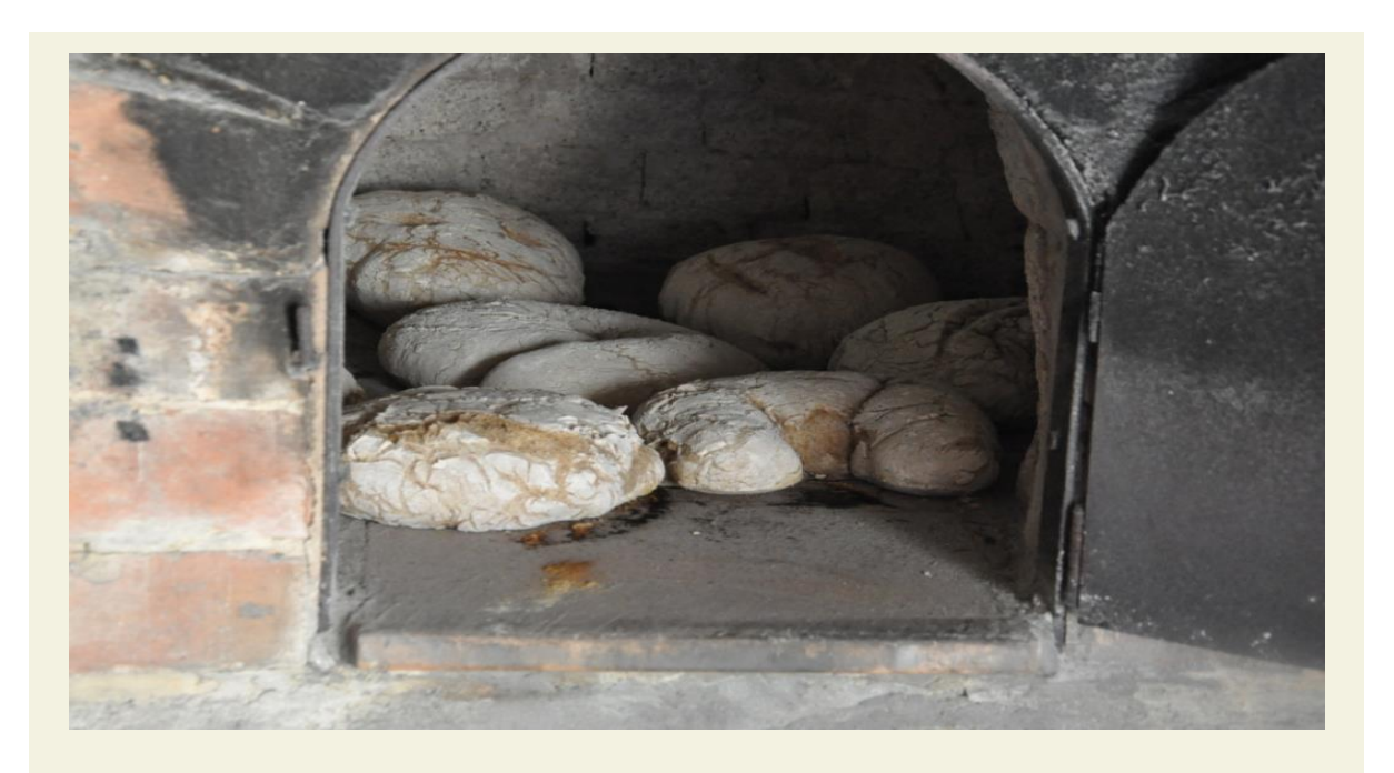
Wood oven cooked corn bread

Learn how to make corn bread and cook it in a wood oven, fun and delicious at any age!