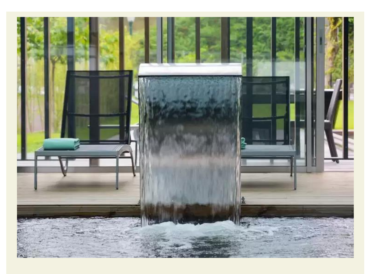
Thermal bath in the Azores

The Azores are the perfect place to enjoy a truly complete trip , with a number of active experiences to choose from and the thermal spa options for the best ending to every day!