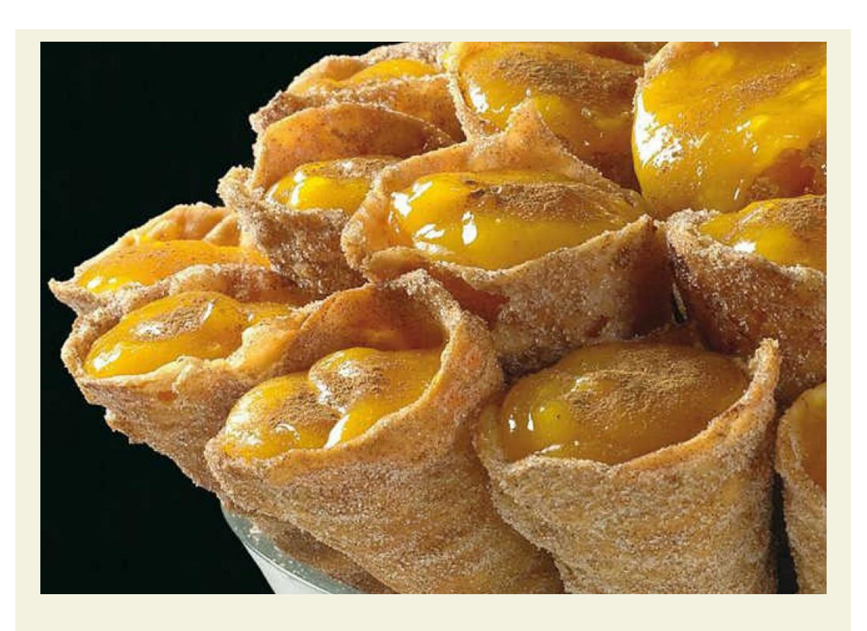
Convent Sweets Festival in Alcobaça

Gastronomy is a very big thing in Portugal and our Convent Sweets play a big role in this category. In November the Convent Sweet festival in the Alcobaça Monastery showcases the very best that we have to offer!