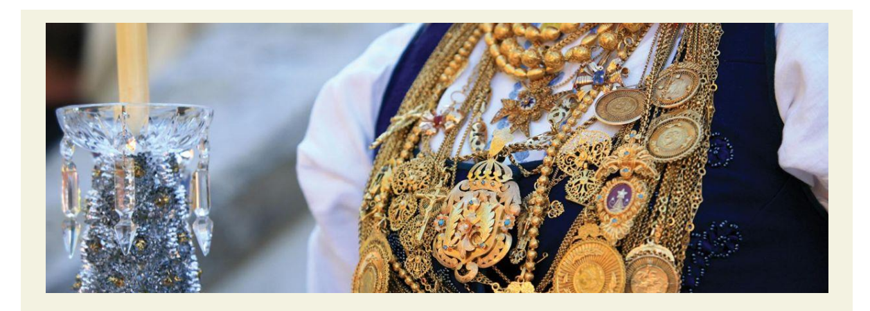
Festival of Our Lady of Agonia

One of the most traditional festivities of Portugal, " Our Lady of Agonia ", must be experienced to be understood . The filigree gold is also a big part of the festival and it's possible to view the making of these amazing pieces of jewelry!