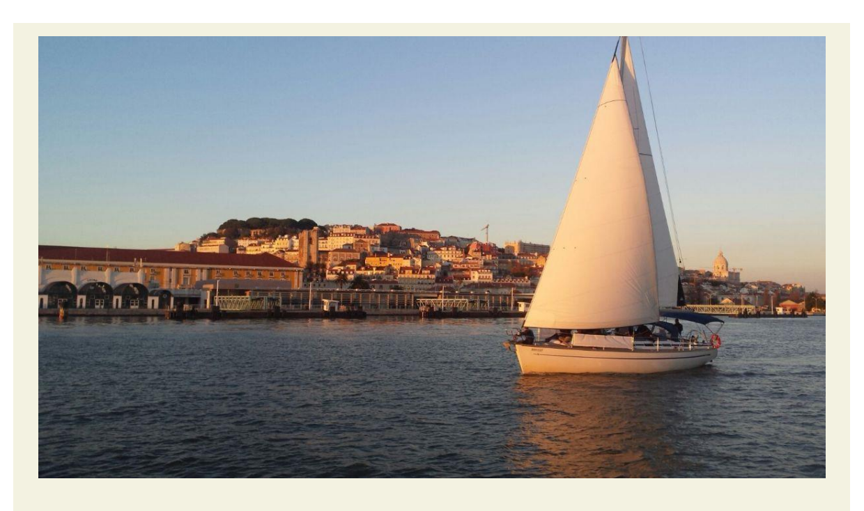
Sunset Sailing in Lisbon

Viewing the city of Lisbon from the Tagus River at sunset is a perfect ending to any day when visiting this amazing city!