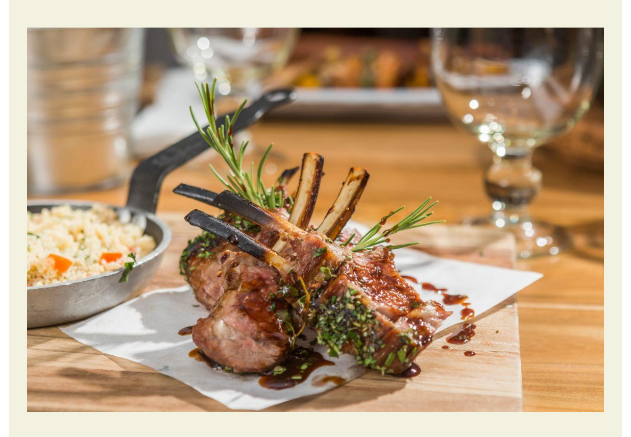
Cooking Workshop with countess or chef

Learn how to make some typical Portuguese specialties with our famous chefs! A visit to the local market can start off this amazing experience and our chef will explain everything about the culture behind the Portuguese cuisine !