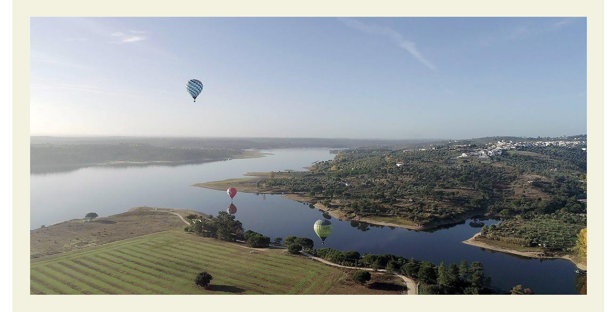
Ballon ride over the Alentejo

Viewing the city of Lisbon from the Tagus River at sunset is a perfect ending to any day when visiting this amazing city!