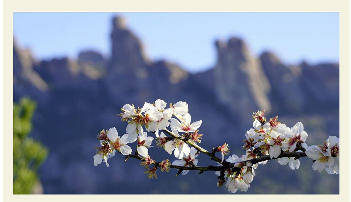
Almond Trees in Bloom

One of the most traditional festivities of Portugal, " Our Lady of Agonia ", must be experienced to be understood . The filigree gold is also a big part of the festival and it's possible to view the making of these amazing pieces of jewelry!