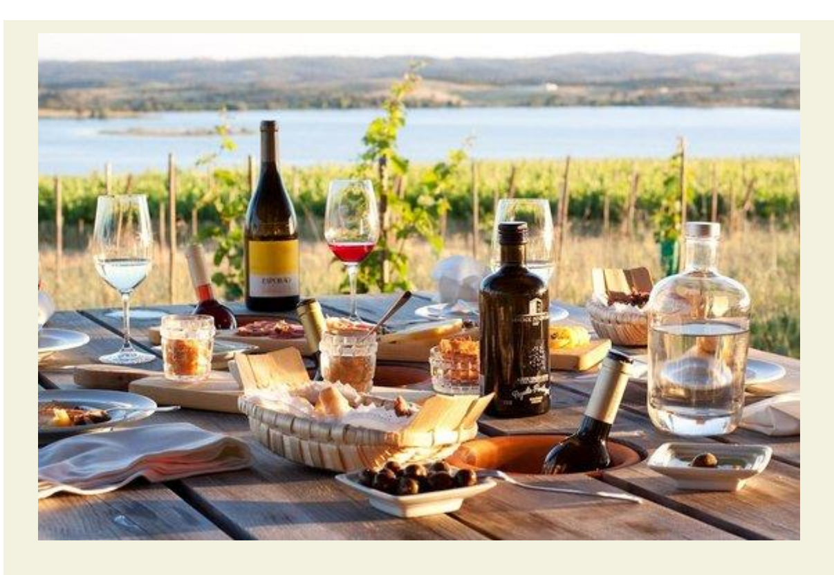
Wine tasting and lunch at Herdade do Esporão

Wine tasting and lunch at Herdade do Esporão can be a life-changing moment :)!