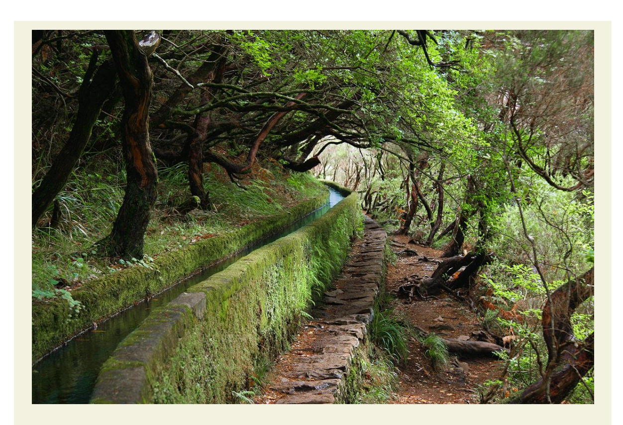
Hike a Levada in Madeira

The Levadas on the Madeira Island are a number of waterways that can be a leisure hike or a more ambitious option. There are many to choose from. One thing is certain, they are all unique in scenery!