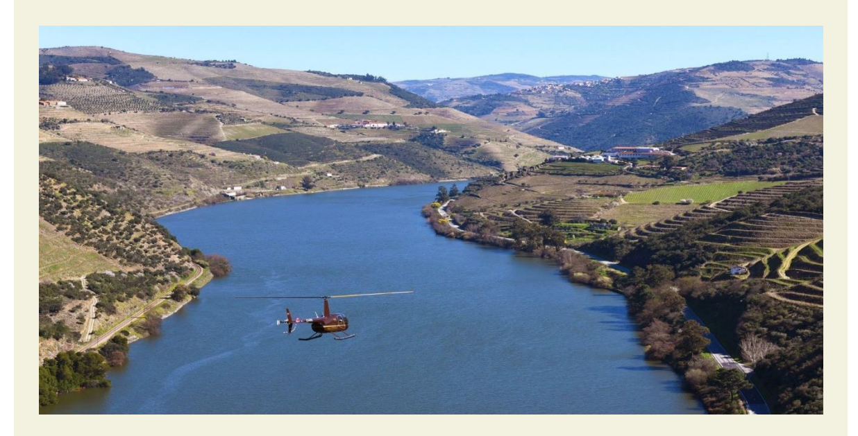
Helicopter Tour in the Douro Valley

Besides tile painting, the pottery tradition is still a very popular craft in Portugal. Making your own special piece of art will be a great memory to take home!