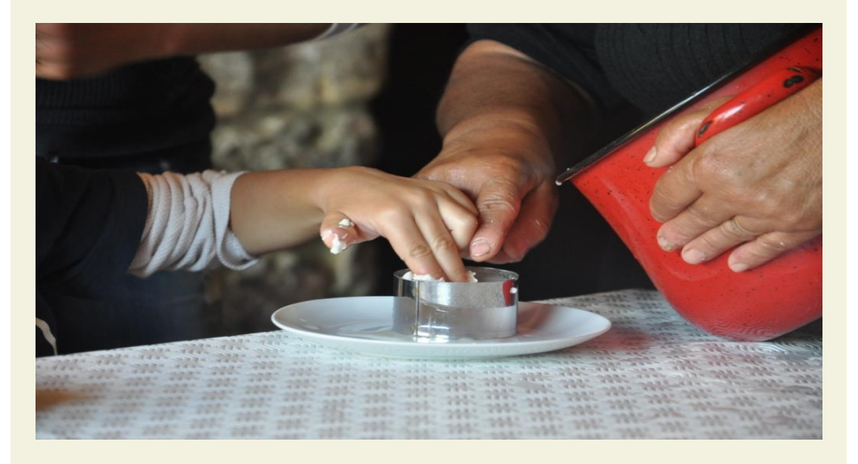
Making goat cheese

Learn how to make corn bread and cook it in a wood oven, fun and delicious at any age!